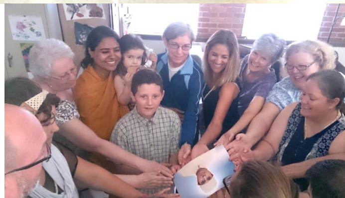
Davenport Iowa, US