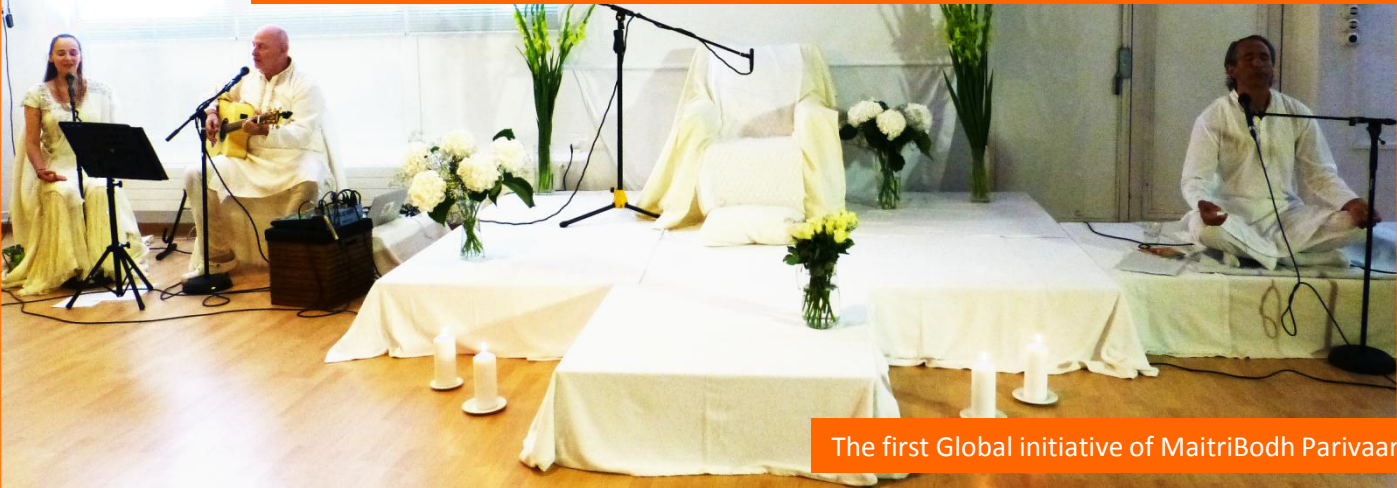
The first Global initiative of MaitriBodh Parivaar