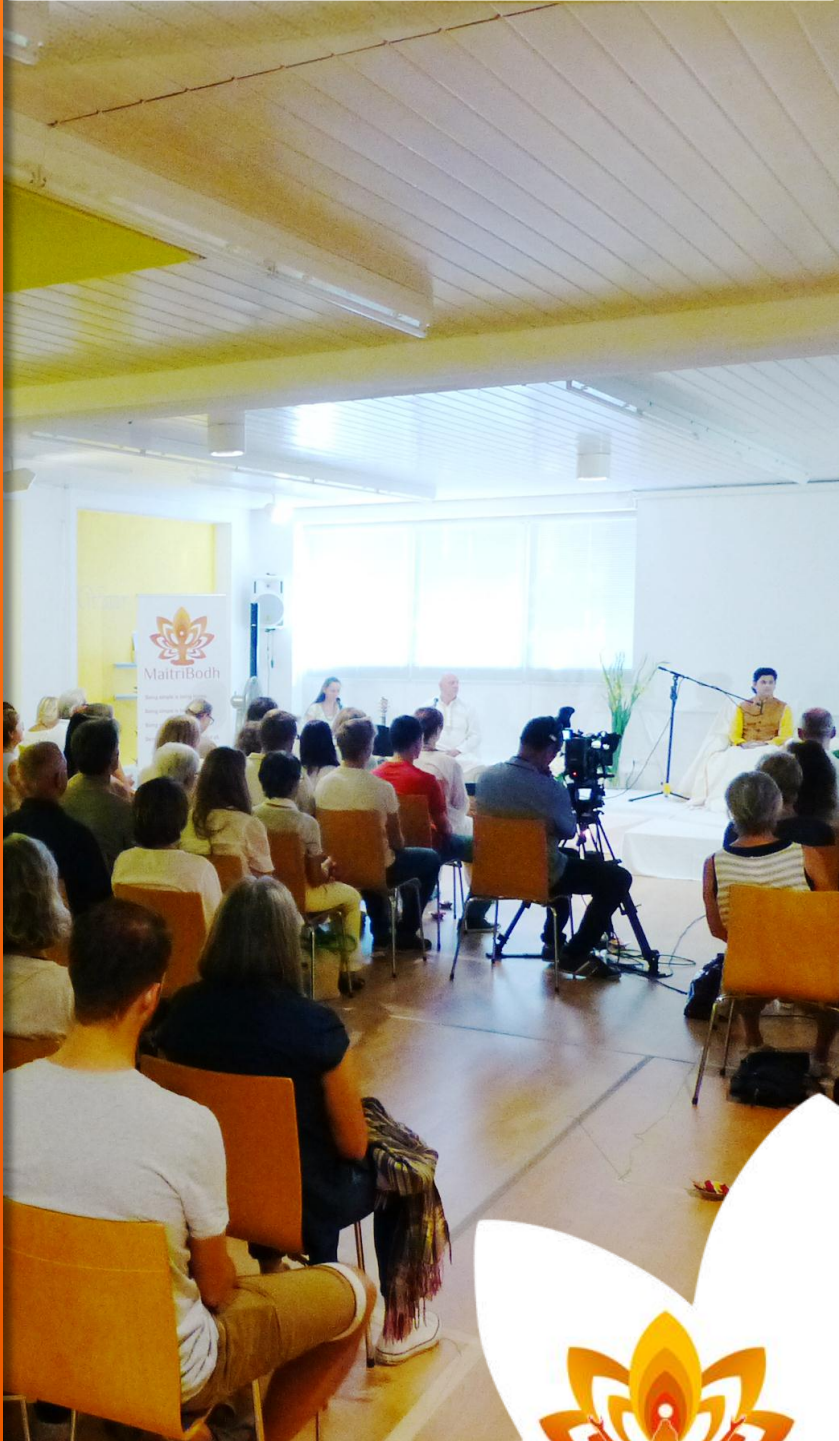
Cover pic: Meditation with Divine; Live with Divine Friend Dadashreeji